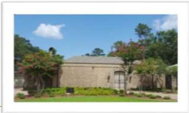
Sally Scholz 302 Gessner Rd.